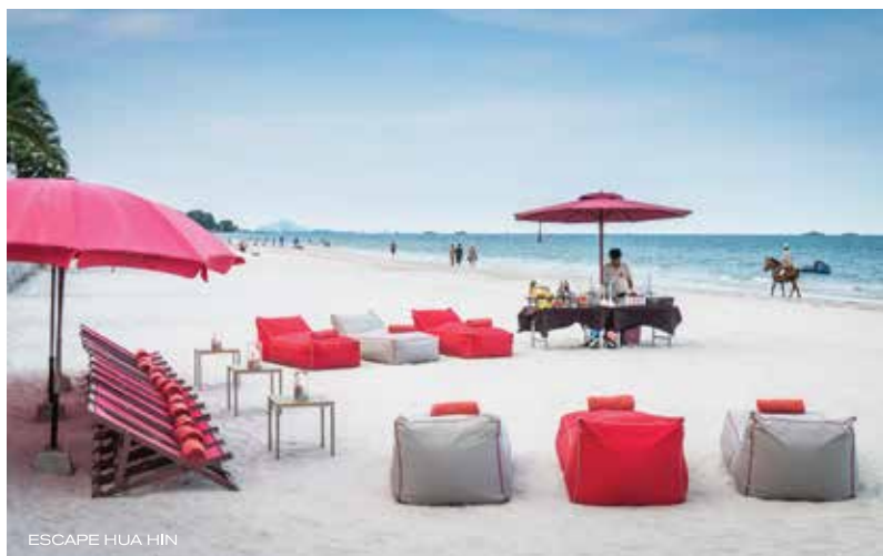
ESCAPE HUA HIN