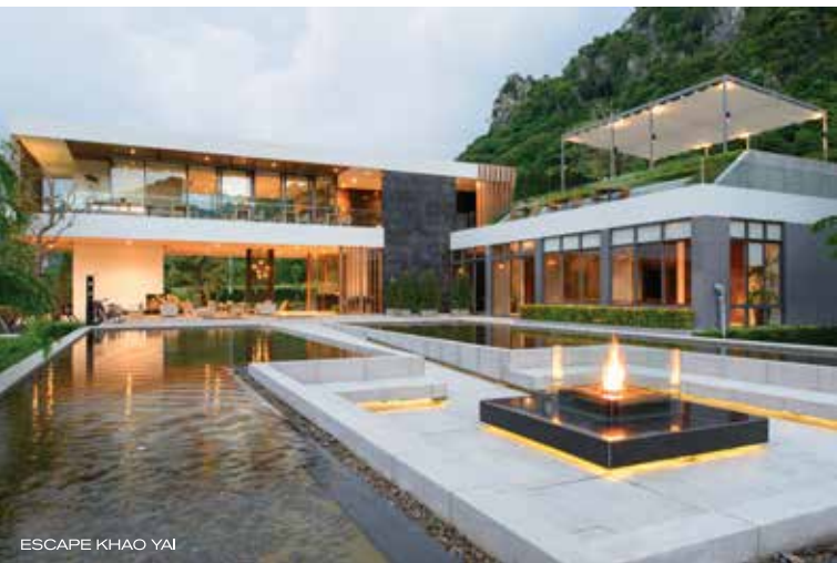
ESCAPE KHAO YAI