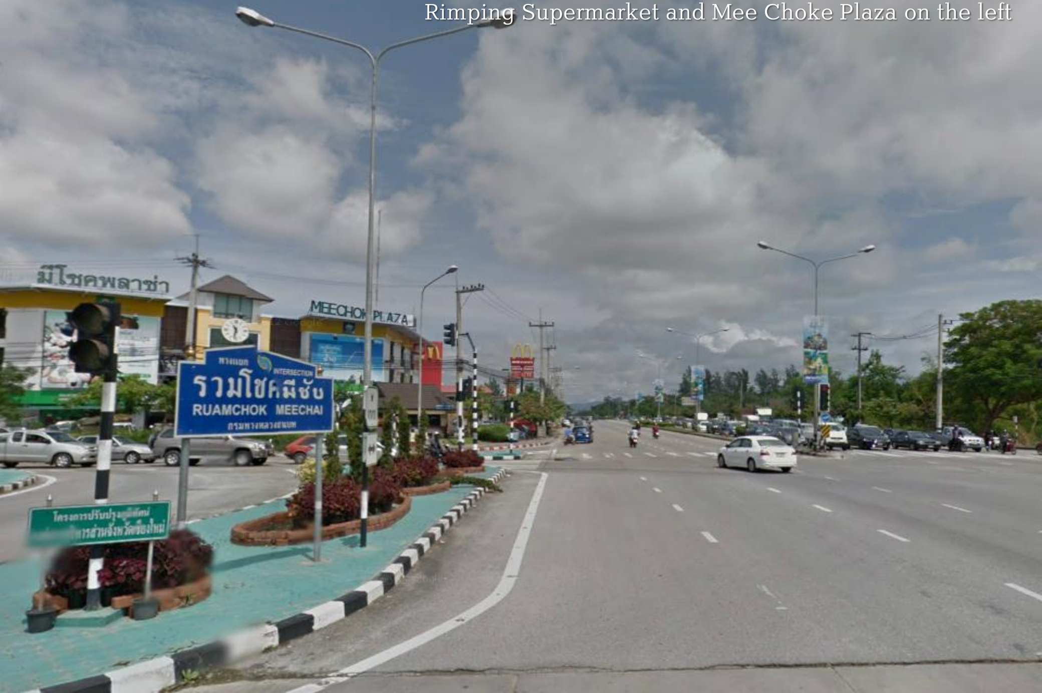
Rimping Supermarket and Mee Choke Plaza on the left