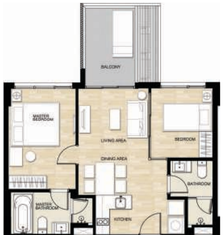
2A - 1