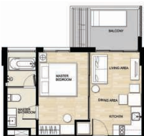
1B - 1